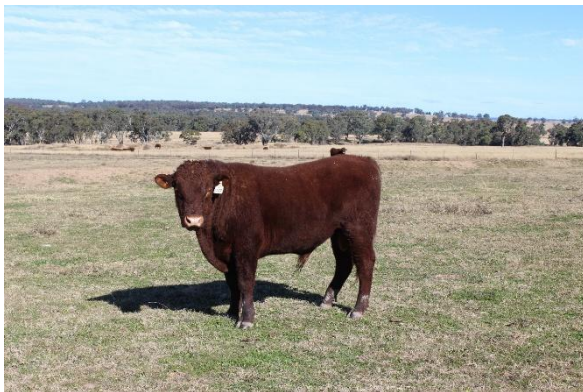
A heterozygous poll bull. Weighed 3 rd May 2025 486kg.