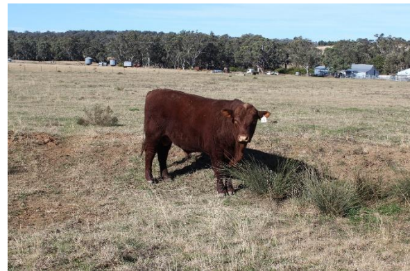
A homozygous poll bull. Weighed 3 rd May 2025 522kg.