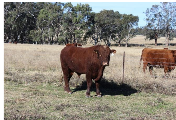
A homozygous poll bull. Weighed 3 rd May 2025 518kg.