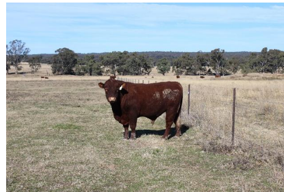
A heterozygous poll bull. Weighed 3 rd May 2025 572kg.