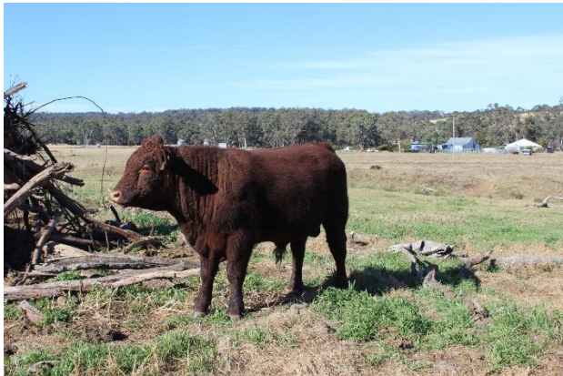
A homozygous poll bull, Weighed 3 rd May 2025 493kg.